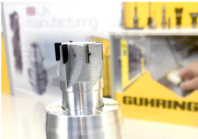
Guhring UK has sent metal 3D printed tools to customers to test new concepts.

The first 3D printed tool Guhring UK made was a basic milling cutter using H13 Tool Steel. “Within one day, we had designed and printed a tool in Onyx [nylon mixed with chopped carbon fiber], and we could immediately see if we were going to come up against any problems in manufacturing it. Within five days, we had printed and sintered a fully functional metal cutter body. Using Markforged 3D printers just speeds up everything.” After adding the cutting tips, Guhring ran the initial tool as a reamer to cut aluminum, and found that it performed extremely well. The engineers then changed the configuration of the tool-tip geometry and ran the 3D printed tool as a milling cutter to test its capabilities, with an off-centre loading. This too worked exactly as planned. The 3D printed tool is 60% lighter than its traditional predecessor, which allows for faster tool changes in cycles and a reduction in cycle times. This application discovery has allowed the company to produce more versatile, lightweight tools for its customers at a far lower price.