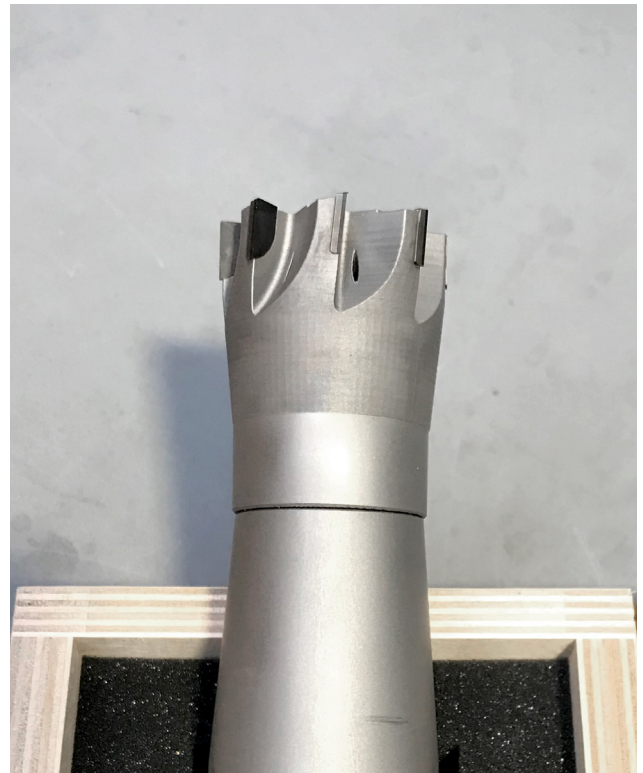
Tool tips were fixed to the 3D printed body before being ground to the required shape.

“From verifying the tool's design to printing the tool, we can vastly reduce the lead time with 3D printing, as opposed to manually machining the parts.”