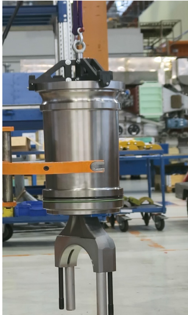
The tool is capable of lifting up to 960kg with a safety factor of four.

GIUSEPPE SARAGÒ, DIRECTOR, MANUFACTURING EXCELLENCE, WÄRTSILÄ