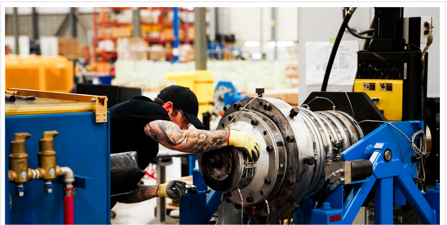
Mechanical Designers at the company have utilized their Markforged composite printer to fabricate tools and fixtures for a pick and place machine.